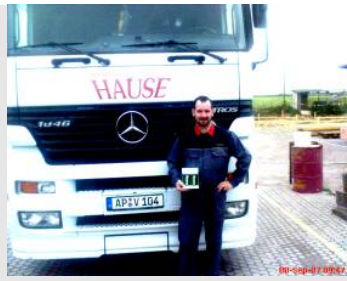
Conveyance HAUSE GmbH from Rittersdorf, Utilization on Mercedes Actros – Engine, gear and differential:

„...My focus of the utilization were the fuel savings. After the use on my engine, gear and differential I had fuel savings of 11.5 %. (Excerpt from test report)...“