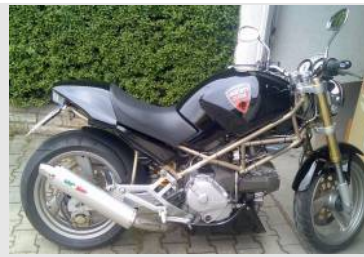
Capasso Gennaro from Stuttgart – Utilization on Bike Ducati Monster 600:

„...My focus of the utilization were the fuel savings. After the use on my engine, gear and differential I had fuel savings of 11.5 %. (Excerpt from test report)...“